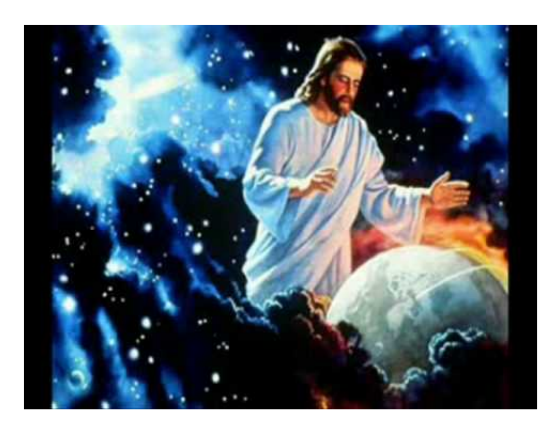
Gen. 1:26a "Then Yahveh said, 'Let us make man in our image, in our likeness."

Yahveh and Yeshua, in unity, are saying, "let us make man (Adam) in our image". This is not referring to all mankind, only to the original Adam man.